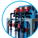
陶瓷硬密封球阀 Ceramic hard sealing ball valve