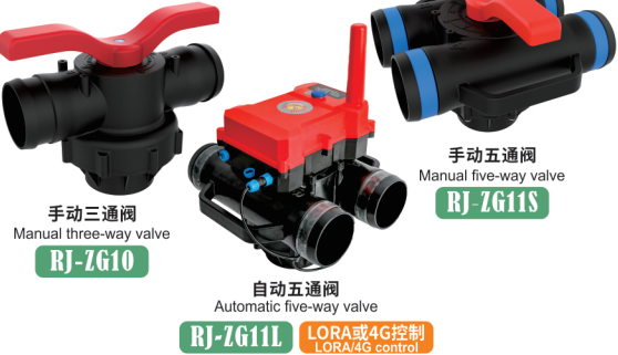
手动三通阀 Manual three-way valve RJ-ZG10