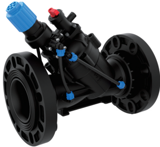
2.5寸3寸4寸 2.5-inch 3-inch 4-inch

Ceramic Hard Sealing Bottom Valve (for water pumps) RJ-D3/D4